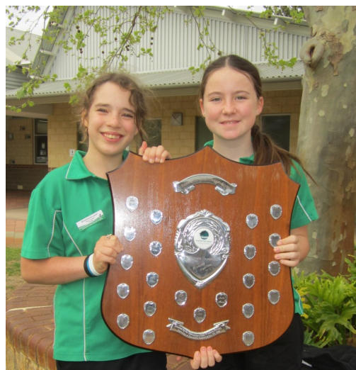
Congratulations to Swan on their Athletics Carnival win. Well done!