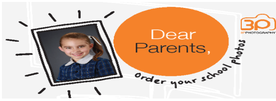
PHOTO DAYS: Thursday 24 & Friday 25 August 2023 - Do not return envelopes before these dates.

PLEASE READ THE FOLLOWING INFORMATION FROM THE PHOTOGRAPHER.