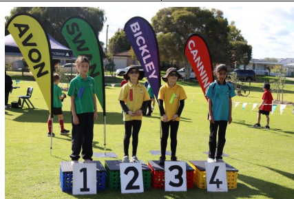
Year 4 Girls