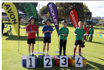
Year 4 Boys