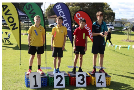
Year 6 Boys