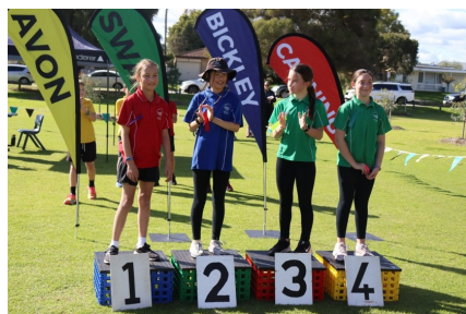
Year 6 Girls