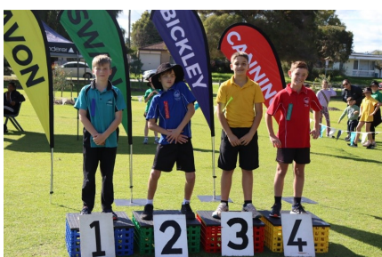
Year 5 Boys