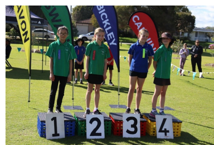
Year 5 Girls